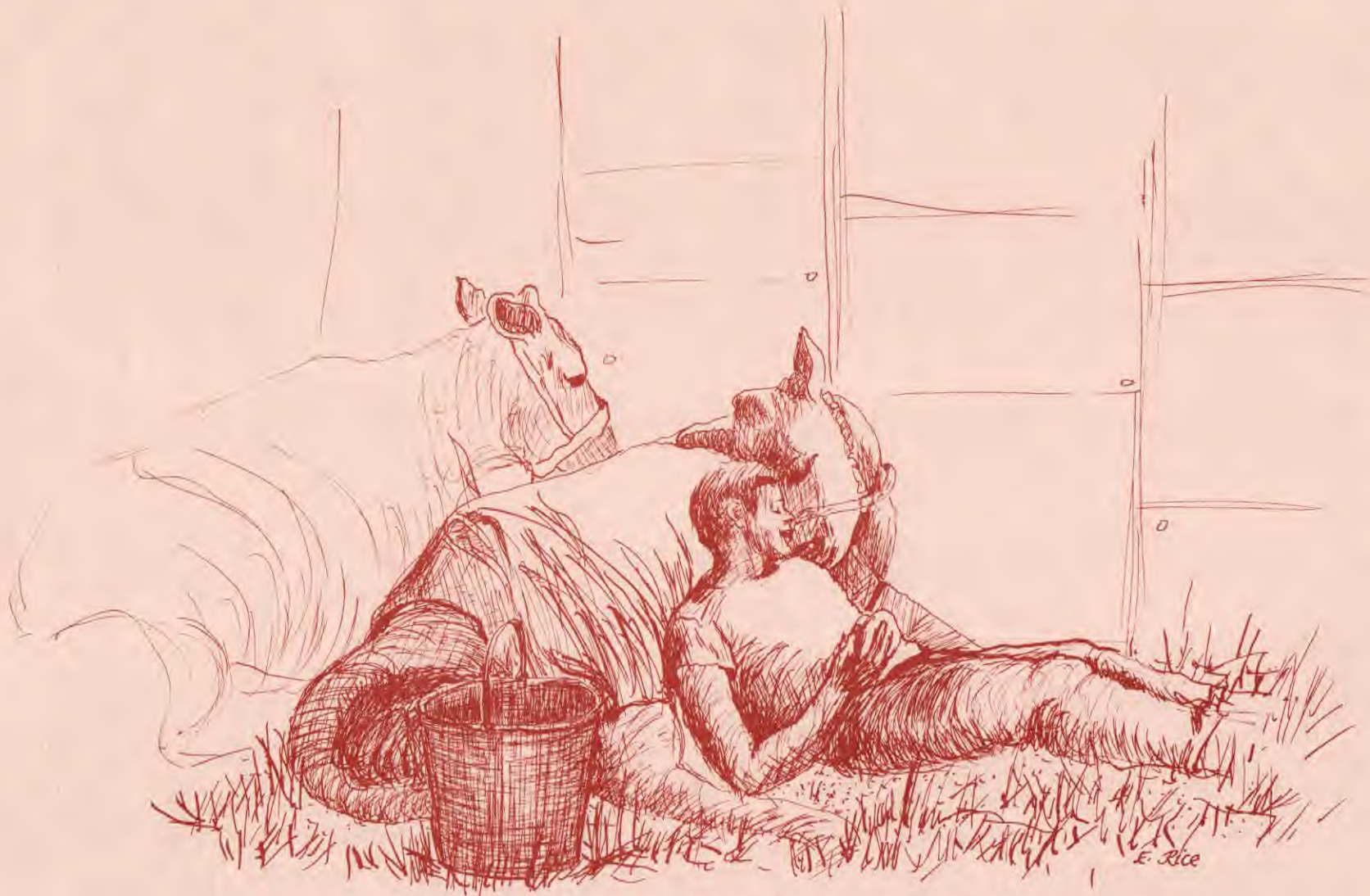
A familiar sight during fair time