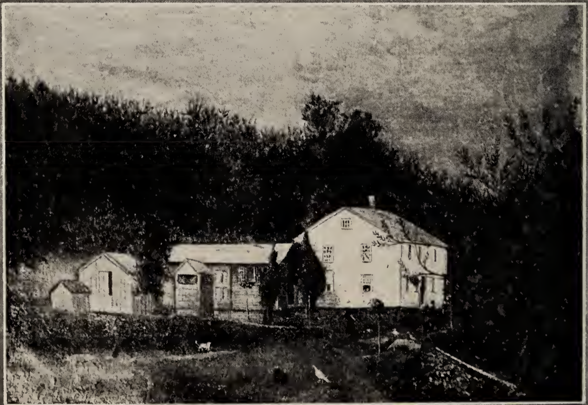
SOLOMON F. ROOT FROM A PAINTING BY MARVIN ROBBINS THE ROBBINS HOUSE FROM A PAINTING BY MARVIN ROBBINS